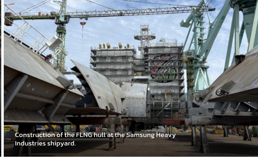
Construction of the FLNG hull at the Samsung Heavy Industries shipyard.