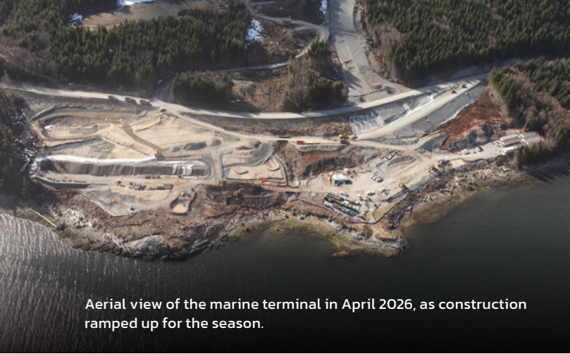
Aerial view of the marine terminal in April 2026, as construction ramped up for the season.