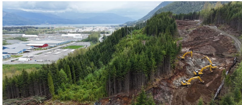
LHLP crews prepare the cleared right-of-way for pipeline construction.

Pipeline construction commenced earlier this spring, and Cedar LNG is proud to share that several Haisla members have joined LHLP to build this critical piece of project infrastructure. Construction of the pipeline is expected to be completed in Q4 2026, with other project components advancing in tandem.