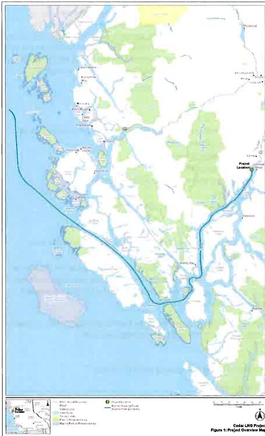
Figure 1 Designated Project Overview Map