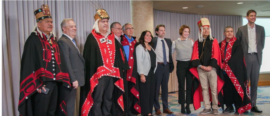
Haisla Nation and Pembina Pipeline representatives are joined by Premier David Eby.

The environmental approvals come after more than a decade of work by the Haisla Nation, and marks a significant milestone for the Project, the Haisla Nation and their partnership with Pembina.